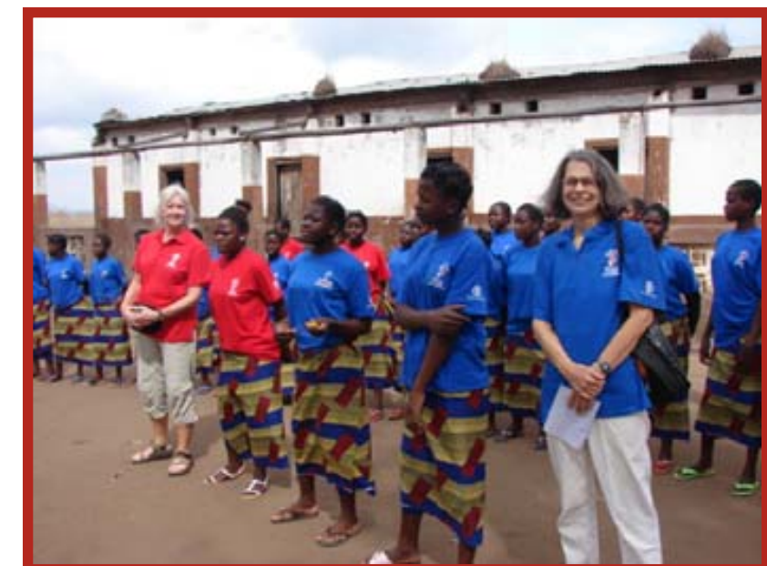
Sixty girls from small villages lived in the Molumbo Lar to attend grades 6-10 during the 2009 school year. The girls, dressed in new shirts and capulanas, entertain visitors, their parents, and Lar staff members with song, dance and short skits.