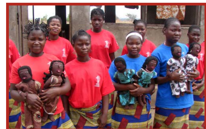
The girls use anatomically correct African dolls to perform a skit that chronicles the shenanigans of various couples. All die of AIDS except one man who they reveal wearing a condom. One in three sexually active adults in Mozambique is HIV positive.