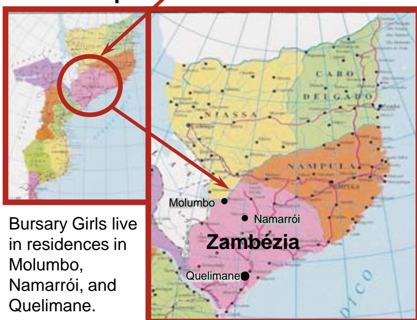
Bursary Girls live in residences in Molumbo, Namarrói, and Quelimane.