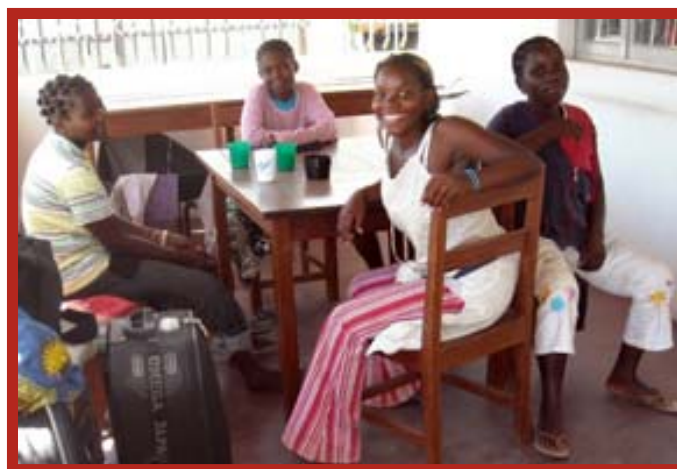
Four of the six "bolseiras" who attended 11th grade in Quelimane during 2009 relax at CCM headquarters. (March 2009).